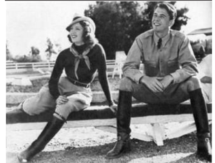
They included Ronald Reagan

She was "The Ultimate Movie Star." Her lovers included every man that mattered in Hollywood.