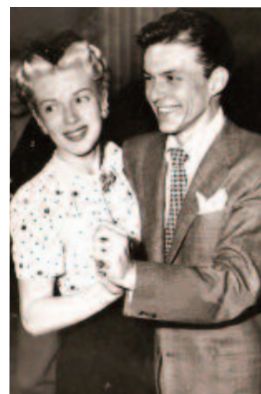
and Frank Sinatra